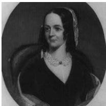
Sarah Josepha Hale, Author of "Mary had a little lamb."