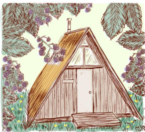
A-frame drawing by Sophie Wood Brinker